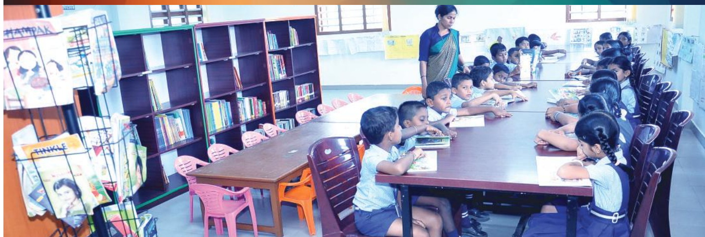
Photograph: Students engaged in a library session.

Studies show that children who read for pleasure from a young age are much more likely to do well throughout their academic life. We firmly endorse the fact that the enthusiasm and responsiveness of the librarian generally had a direct impact on the attitudes of the students towards the library and reading. We set up the library last year, with aid from M/s Mahindra Holidays & Resorts Ltd. At our school, library is an integral part of the learning process. The Librarian will collaboratively plan and teach with the classroom teachers. Library activities will be tailored to: