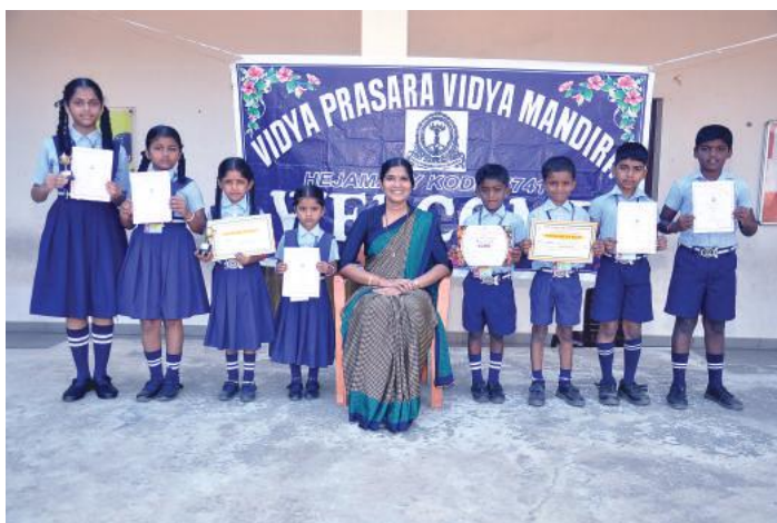
2nd State Level Inter Dojo Karate Championship - Budokan Dhamaka 2018