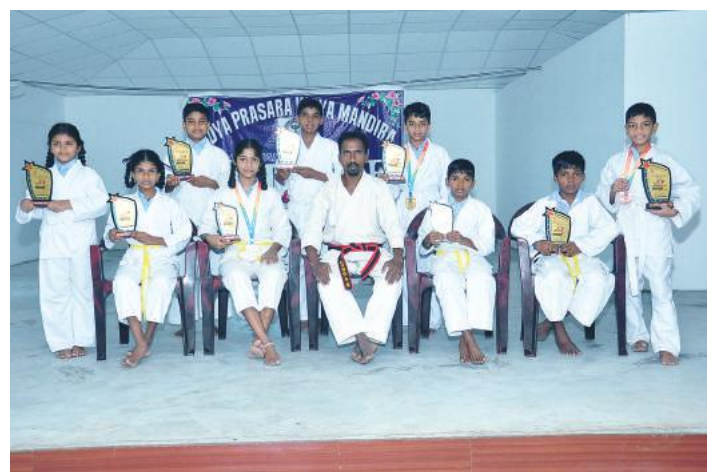
State Level Karate Competition - Manipal

In the State Level Karate competition held at Ken-E-Mabuni-Shi-tu-Ryu-Karate School of India in Manipal our students won 5 first prices, 3 second prices and 4 third prices.