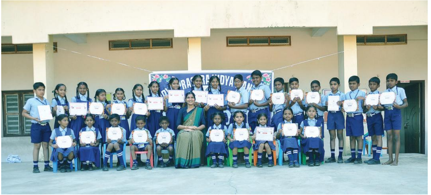
Prathibha Karanji 2018-19: In cluster level Prathibha Karanji our school students bagged many prizes, (See the list below)