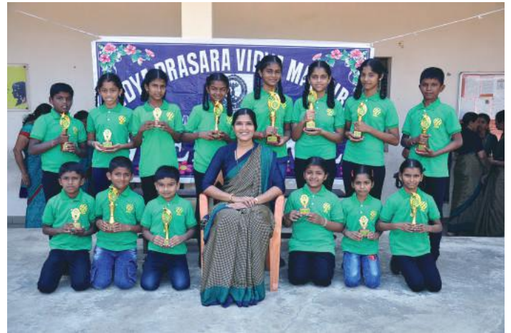
Our Abacus champions with their trophies

On 27th October our students participated in the 13th state level Abacus competition, which had about 1,200 participants.