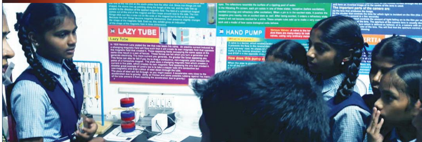
Photograph: Students discussing a project in the mini science center at the school.

HKVP's Vidyaprasara Vidya Mandira believes in providing 'Critical Thinking Spaces' that are both student-centered and student-driven, where students are allowed to critically think and have them productively struggle and fail, learn from those failures and work their way through the problems. It's really a creative and exploratory way of learning, one that they will never forget.