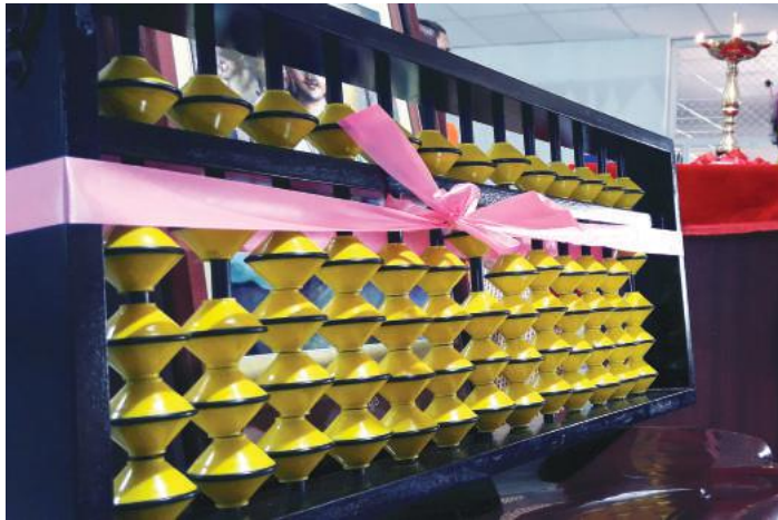
Introduction of Abacus

We have introduced Abacus in our school in this academic year 2018-19 as an aid in teaching the numeral system and arithmetic. There are two levels - Level One which is an elementary level for students aged between 5 to 8 years. There are a total of 73 students in this level. Level Two is a regular level for students aged between 9 to 13 years. There are a total of 54 students in this level.