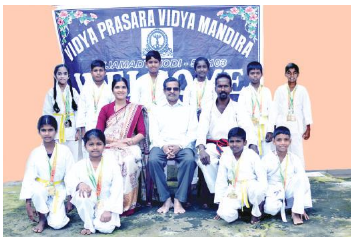
2nd State Level Inter Dojo Karate Championship - Budokan Dhamaka 2018