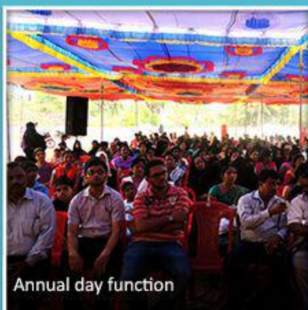
Annual day function