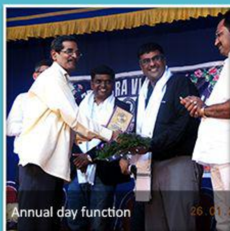
Annual day function