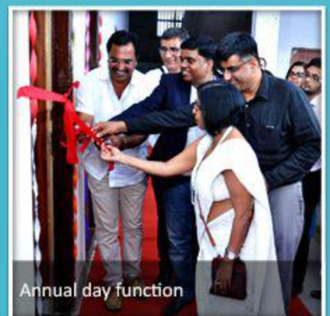
Annual day function