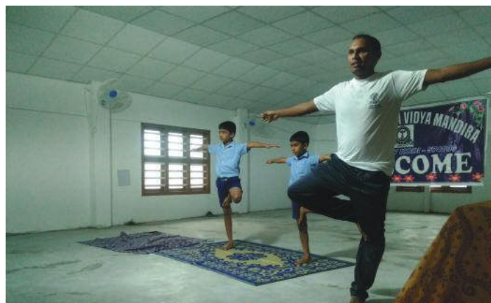
Photograph: Yoga Practice

It is important to allow children be as children and grow in the lap of nature. As a part of International Sports Day, the school has organised this event to play in the paddy field filled with monsoon water. Students are provided with information about cultivation, difference between organic and inorganic cultivation and identify the various types of crops. Various sports programs like dog and the bone, running race, treasure hunt are organised on this day to allow students to have fun while learning outside the classroom.