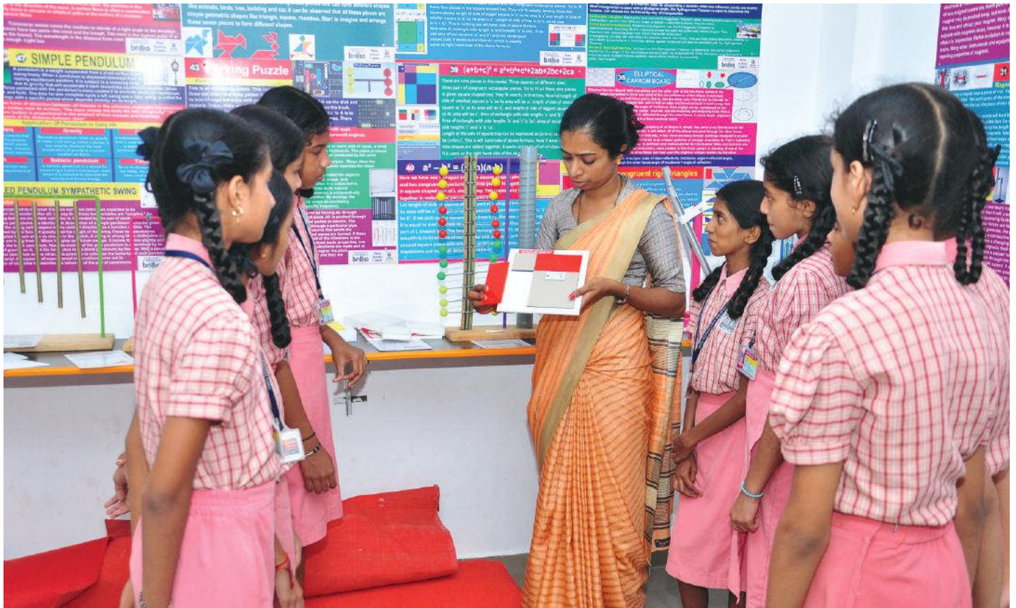
Teacher explaining the derivation of algebraic formula (A+B)^2 = A^2 + B^2 + 2AB using STEM model in STEM Laboratory

As mentioned in a previous newsletter, our corporate social responsibility partner, M/s Brillio Technology Private Limited, sponsored the setting up of Mini Science Centre (MSC) of STEM Learning at our school. This MSC along with few other such initiatives are aimed at providing 'Critical Thinking Spaces' that are both student centered and student driven, where students are allowed to critically think and have them productively struggle and fail, learning from these failures and work their way through the problems. This helps the students to learn by exploratory way and encourage them to become thinkers.