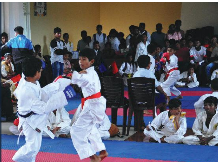
Photograph: Inter-School Karate Competition held at HKVP School

The officials of education department and the principals, parents of other schools appreciated the infrastructure provided by the school and for organizing the event in a exemplary manner.