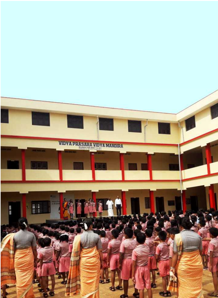
Photograph: Students in a morning assembly gearing up for the day