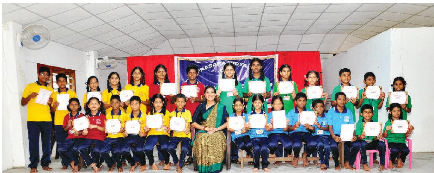
Photograph: Winners of the Pratibha Karanji Event