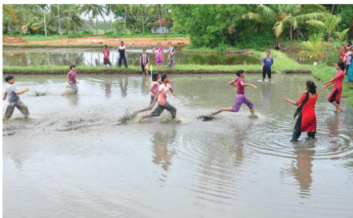
Photograph: Students Playing in mud