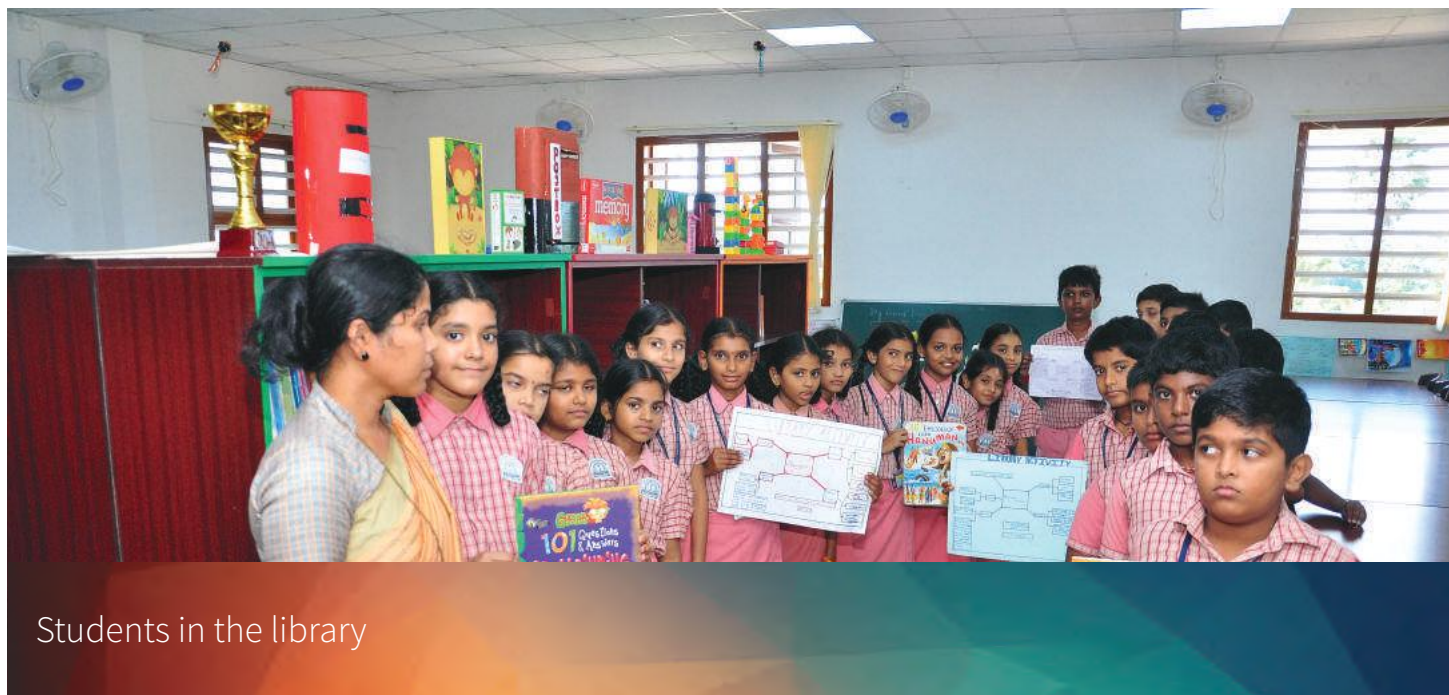
Students in the library